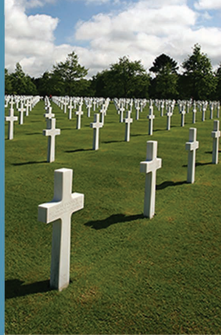
Battlefield Staff Ride with COL Len Kloeber Pinnacle moments of the Second World War...in living color!